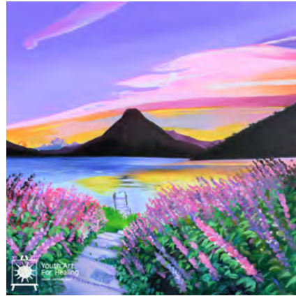
Paintings by student artists from Richard Montgomery High School (left) and Montgomery Blair High School (right).

A huge THANK YOU to everyone who contributed to the success of the 2022-23 school year. Student artists, art teachers, parents, healthcare partners, community businesses, and donors - you ALL played critical roles in bringing Youth Art For Healing artworks to life!