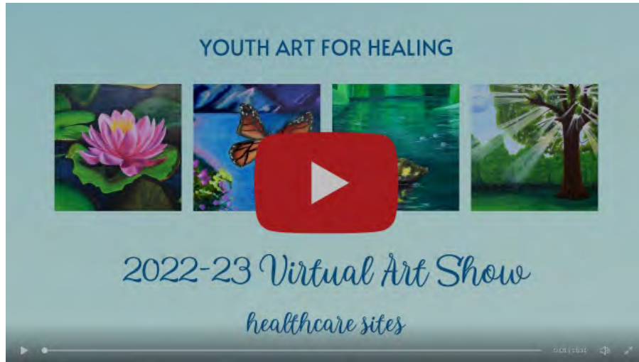
Youth Art For Healing: 2023 Virtual Art Show - Healthcare Sites

In this Art Show, enjoy viewing the 119 paintings created by student artists for permanent installation at five healthcare sites.