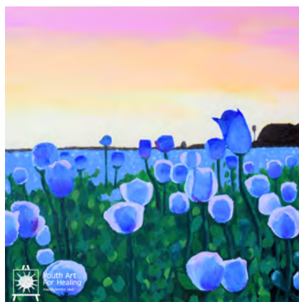
Paintings by student artists from Thomas S. Wootton High School (left) and Charles H. Flowers High School (right).

The Virtual Art Shows below showcase the students' artistic talent and giving to others. Enjoy these presentations of their vibrant and uplifting paintings. You can also view the students' artworks and our Virtual Art Shows on our website www.YouthArtForHealing.org .