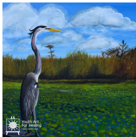
Paintings by students from A. Mario Loiederman Middle School (left) and Wheaton High School (right).

That significant milestone is notable by itself, as a growing body of research suggests that art in healthcare facilities can improve mental, physical, and emotional well-being, quicken recovery, reduce stress on patients and healthcare workers, and create a positive and soothing environment.