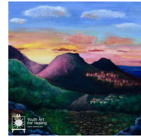
Paintings by students from Montgomery Blair High School (left) and Thomas S. Wootton High School (right).