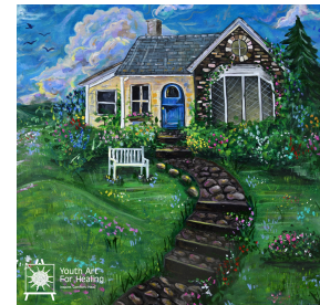
Paintings by students from Richard Montgomery High School (left) and Albert Einstein High School (right).