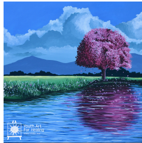
Paintings by students from Charles H. Flowers High School and Watkins Mill High School.

The videos below showcase the students' artistic talent and giving to others. Please enjoy viewing their vibrant and uplifting works of art. You can also view all of these videos and artworks on our website www.YouthArtForHealing.org .