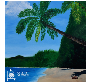
Paintings by students from Richard Montgomery High School and Wheaton High School.

During the 2021-22 academic year, participating schools included: Albert Einstein HS, A. Mario Loiederman MS, Benjamin D. Foulois CPAA, Brightwood EC, Charles H. Flowers HS, Gaywood ES, Largo HS, Montgomery Blair HS, Richard Montgomery HS, Thomas S. Wootton HS, Thurgood Marshall MS, Watkins Mill HS, Wheaton HS, and White Oak MS.