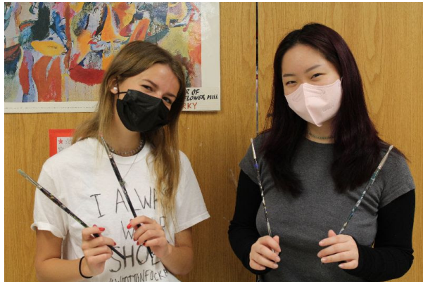
YAFH student artists from Thomas S. Wootton High School.

It's the start of the school year, which brings new opportunities. Due to the pandemic, Youth Art For Healing continues to pivot as we launch our 2021-22 projects. Student artists are creating Gifts of Gratitude paintings for 124 frontline healthcare workers in five hospitals, in addition to 79 paintings for permanent installation at five healthcare sites.