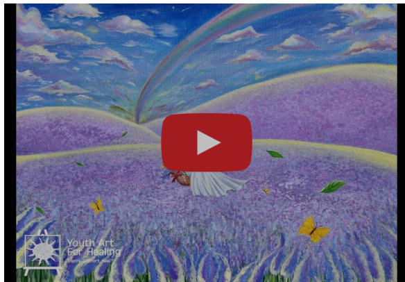
Watch the full version of our 2021 Virtual Art Show.

Take a few minutes to relax and enjoy the full-length version of our 2021 Virtual Art Show, or if time is limited, visit our website to view a shorter version .